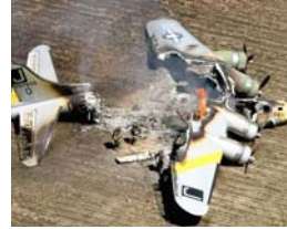
Rare WW II bomber engulfed in flames after emergency landing