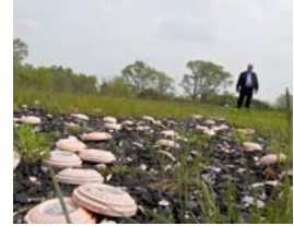
Caught in gears of Cook County government, generations-old gun club faces extinction

MORE: Doctors rethinking prescribing Abbott's Niaspan FBI launches manhunt for Chicago-area weight-loss physician Sir Paul to grace Wrigley Field for July concert