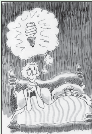
"Gee, Gladys, you used to dream about me!" (See pages 4-5)